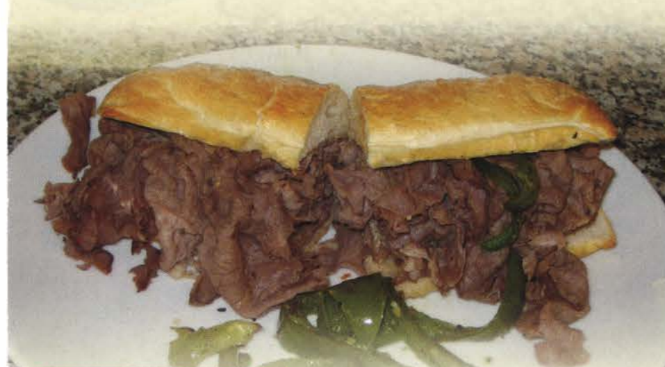
ITALIAN BEEF SANDWICH

Oven roasted turkey, roasted red peppers, provolone, tomatoes, onions & romaine lettuce on toasted bread with honey dijon on the side 7.75