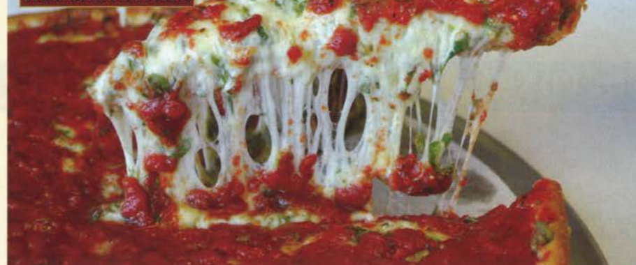
DEEP DISH PAN PIZZA

READY TO BAKE! ORDER YOUR PIZZA "Par-baked" & FINISH BAKING AT YOUR CONVENIENCE