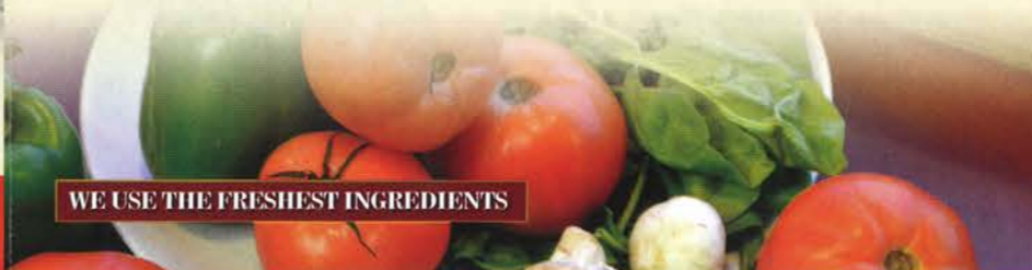
WE USE THE FRESHEST INGREDIENTS

A North Shore tradition for over 30 years